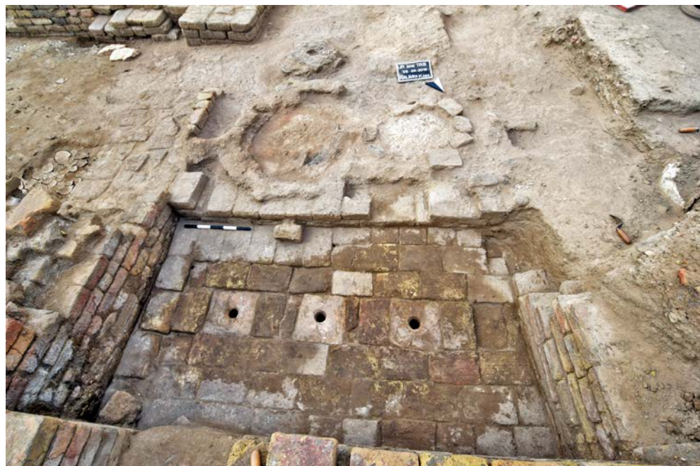
Fig. 3: The kitchen Room 13 with drainage installations and domed ovens