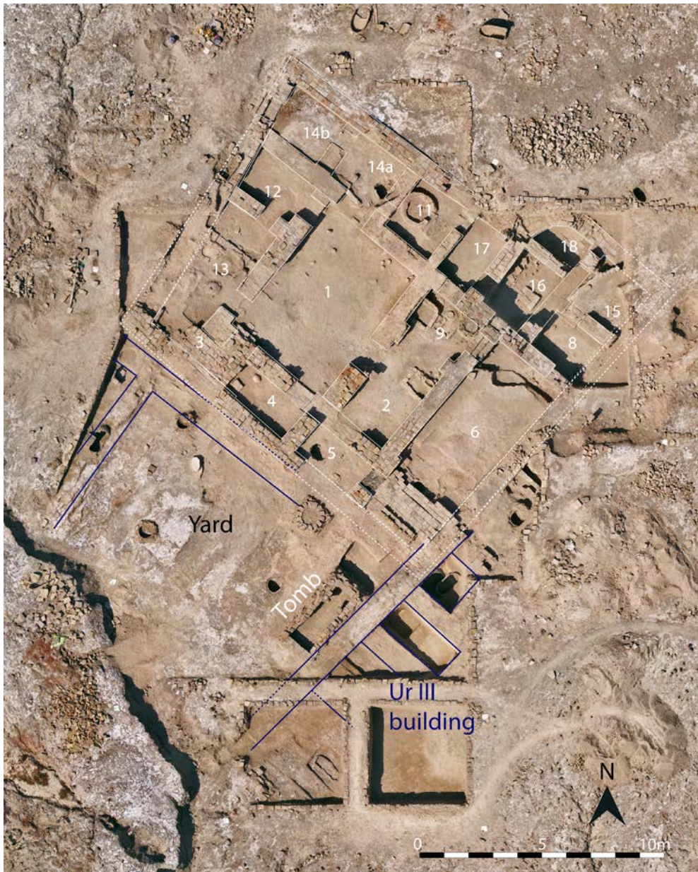
Fig. 2: Area 5, ground plan of the Isin-Larsa house