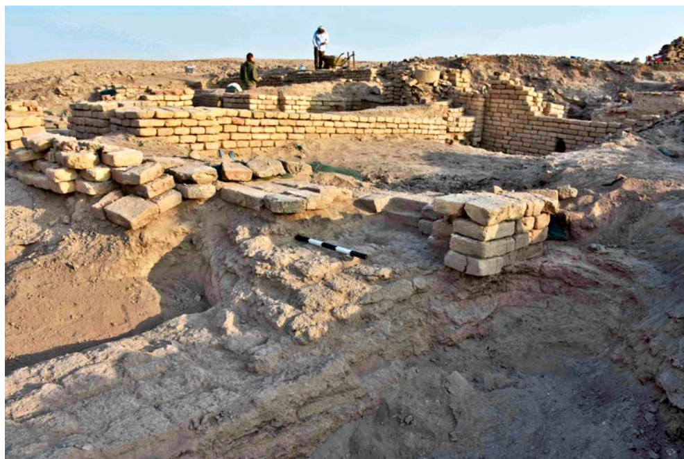
Fig. 5: The Isin-Larsa baked brick wall on top of the Ur III mudbrick wall