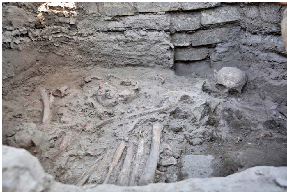
Fig. 6: Longbones and skulls heaped up in the vaulted chamber tomb