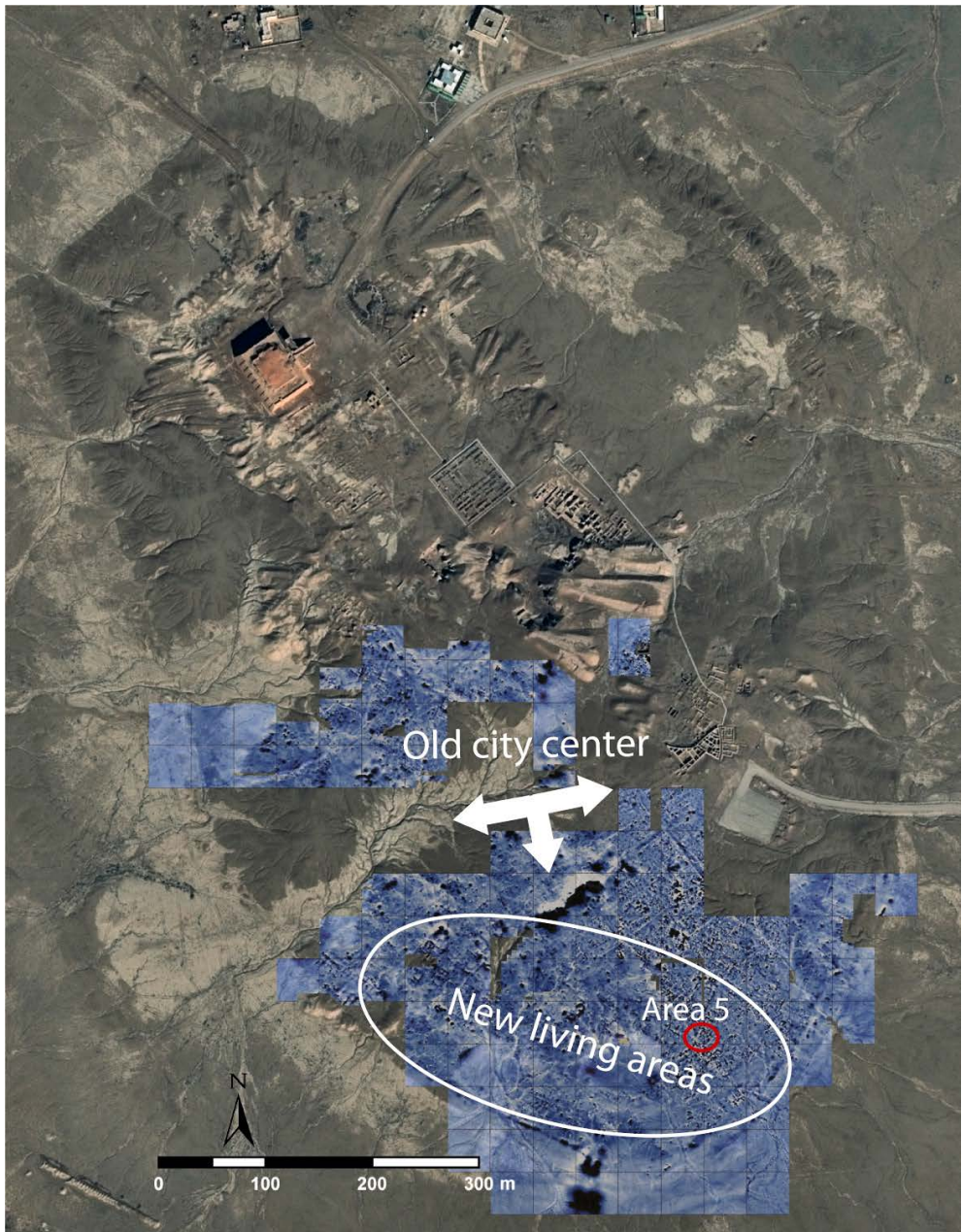
Fig. 7: Proposed settlement development in the mid 19 th century. Aerial photo combined with a magnetogram by J. Fassbinder and M. Scheiblecker (map by B. Einwag)