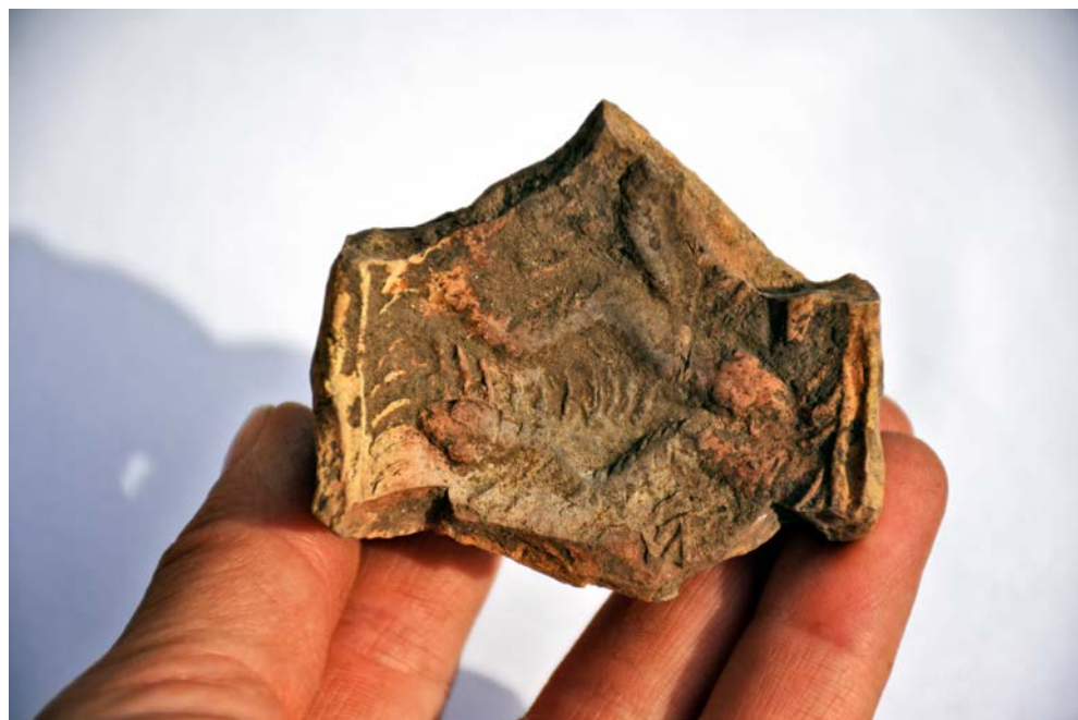
Fig. 4: Terracotta table-like incense burner with crawling snakes